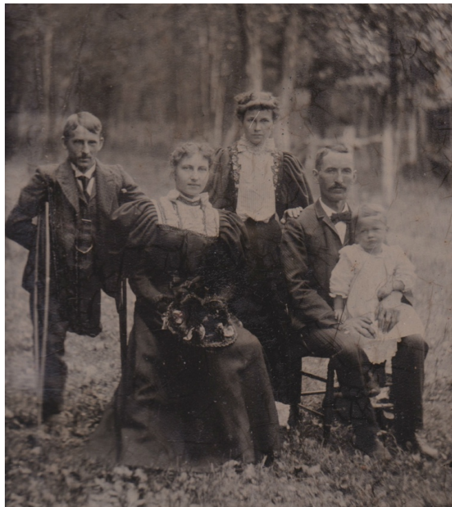
"Late nineteenth-century tintype, instructor's collection."

Accessibility and inclusion for people with disabilities are essential values every public historian is expected to embrace. These values also permeate work in other fields that touch public life, including medicine, secondary education, municipal services, and architecture and design. They have become even more important during the COVID-19 pandemic, which resulted in fundamental changes to the way everyone accesses the world. What is the history of accessibility and inclusion for people with disabilities and others in public life? How does that history affect how people with disabilities engage with and participate in what happens at museums, libraries, and other sites of public history and culture? What is the difference between diversity and inclusion, in theory and in practice? How are they related, historically and today? Through readings, documentaries, assessments of online public-facing programming, written reflection, and discussion with practitioners in history and adjacent fields, students will develop a holistic understanding of the many forms accessibility and inclusion have taken historically and today. This class includes a collaborative project with the New Jersey Council for the Humanities.