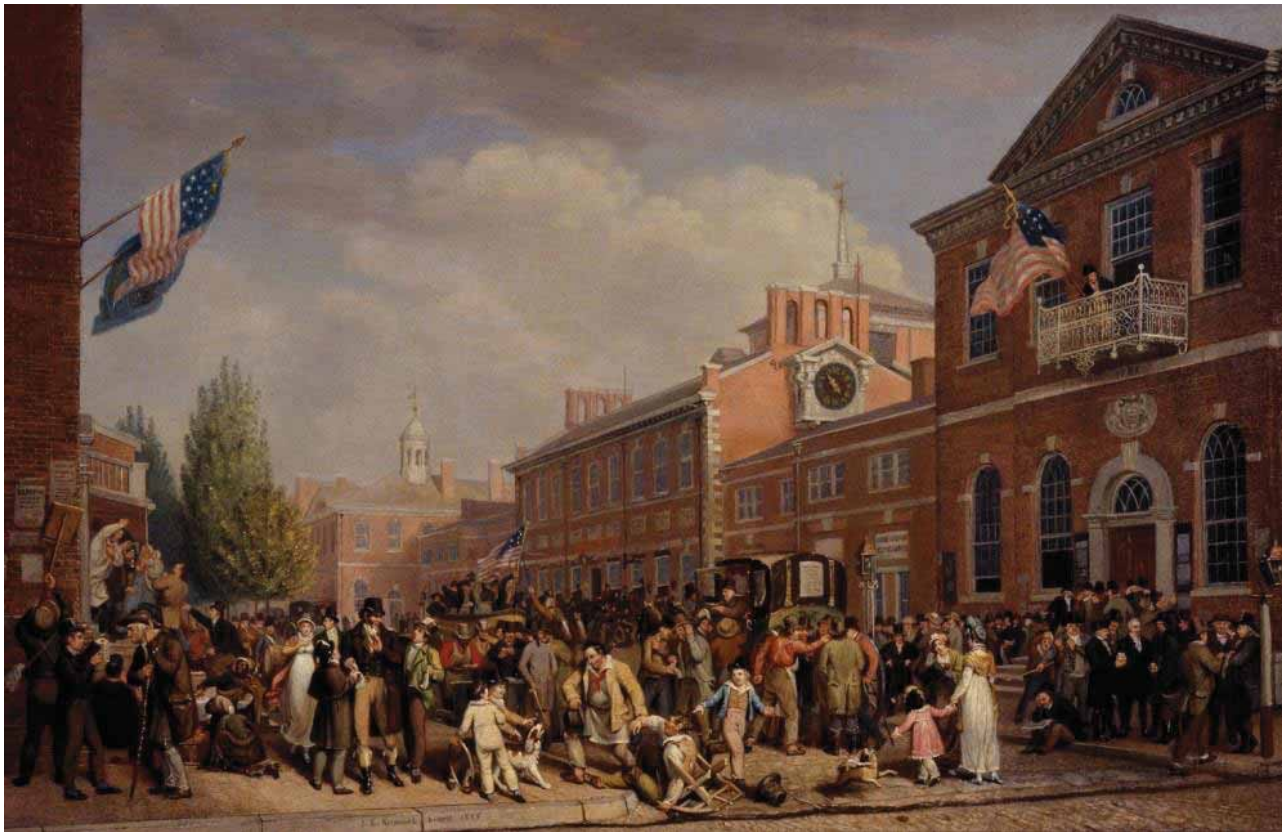
John Lewis Krimmel, Election Day at the State House, 1816

This course investigates the origins of the modern United States. Why and how did a nation conceived in liberty quickly promote the vast expansion of slavery? Why did a society that revolted against British style social and economic inequality end up producing more inequality than had ever existed in the thirteen colonies? How did a nation that few in 1789 believed could survive for even two decades come to dominate the North American continent in the next fifty years? Why did the very way it achieved this domination create the conditions that tore the nation apart in a civil war of unprecedented violence and bloodshed? Do you like your historical figures colorful and crazy? Why by 1793 did Alexander Hamilton and Thomas Jefferson hate each other and have no doubt the other was a traitor and a spy? Why did as many people despise and denounce George Washington as praise him by the time he finished as President? Why did President Andrew Jackson destroy the nation's central bank? And why did he name his favorite horse after a drunkard who died by jumping off a cliff? Why did thousands pay to see watermen send a barge full of animals hurtling over Niagara Falls in 1827? Hey, it's the early republic. Take the course and find out.