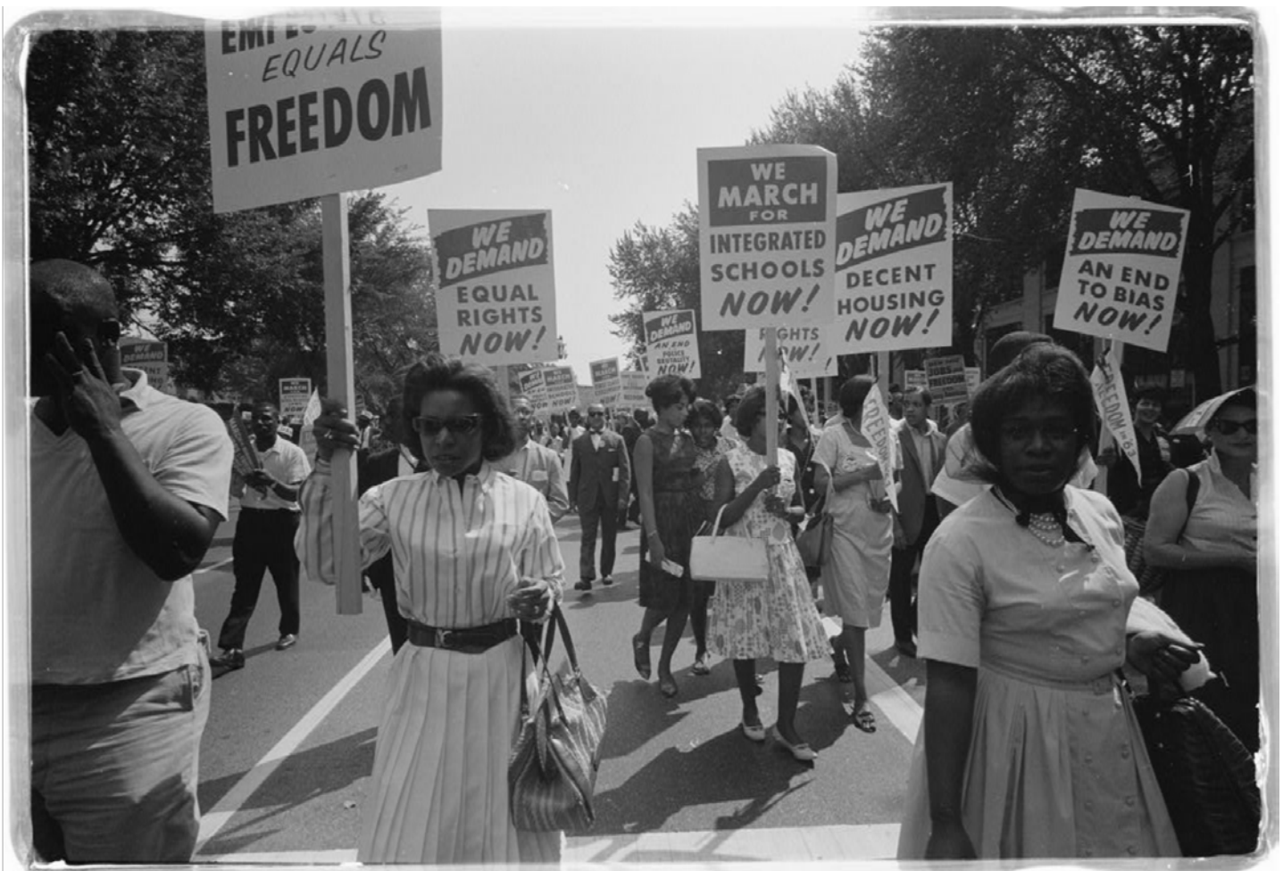
March on Washington, Washington D.C., 1963.

This course provides an overview of the major events and developments in African-American history from 1865 to the present, tracing black leadership and cultural development through Reconstruction, the Jim Crow era, and the civil rights revolution. The course traces African Americans' quest for freedom through periods including World War I, the Great Migration, the Great Depression, and World War II. It then examines key political, social, and cultural developments of the post-war period focusing on social movements such as the Long Civil Rights Movement, the Black Power Movement, the Black Feminism, and the Prisoners' Rights movement. We will end with a discussion on race in the Obama years and the Black Lives Matter movement.