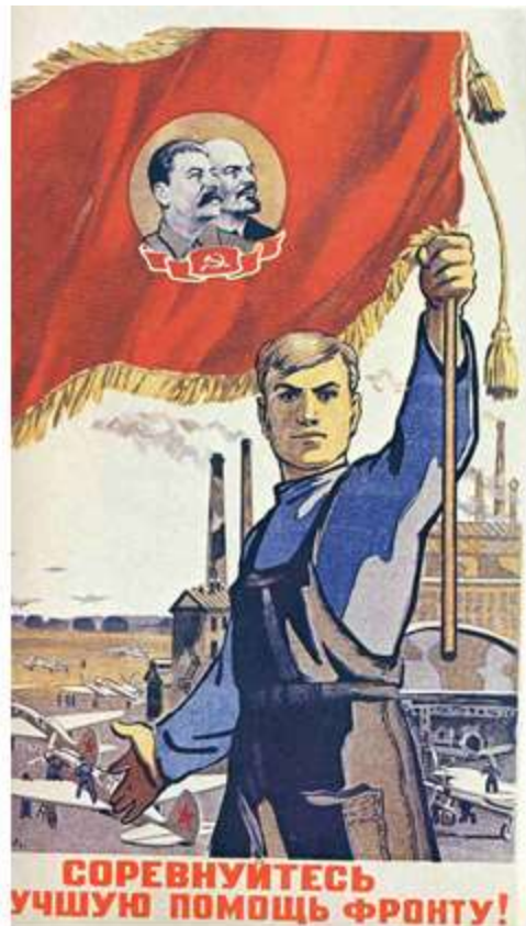
A Russian Propaganda Poster from the Second World War