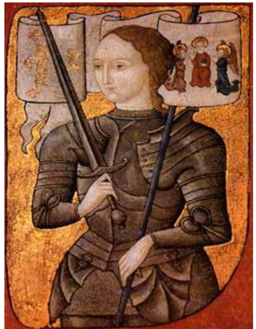
Joan of Arc (1485)