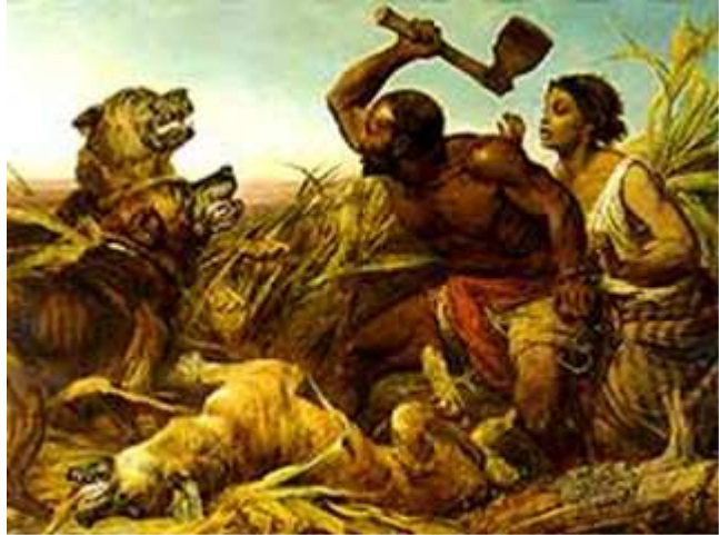
Richard Ansdell, "The Hunted Slaves" (1861)

An introduction to the history of black people in America, with a survey of African background, the history of slavery and resistance to slavery, and the evolution of black leadership through the Civil War. We will also discuss the slave narratives and the impact of slavery on the black family.