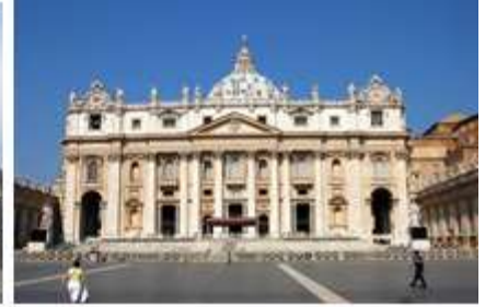
St. Peter's Basilica