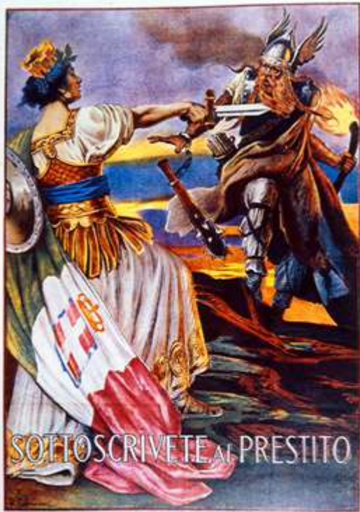
An Italian Propaganda Poster from the First World War

This course will focus on Europe during the most violent and the bloodiest period in its history. Between 1914 and 1945, millions of civilians as well as millions of soldiers died as a result of unprecedented conflicts between nations and also as a result of mass persecutions within nations. Consequently, the status of Europe as a whole in relation to the rest of the world suffered greatly. The course will deal not only with military events but also with diplomatic, political, social, and cultural developments. For the purpose of showing how major events and trends during this period were perceived and evaluated by contemporaries--of showing how history looked and felt to people who lived it—there will be extensive use of visual sources as well as writings produced by contemporaries.