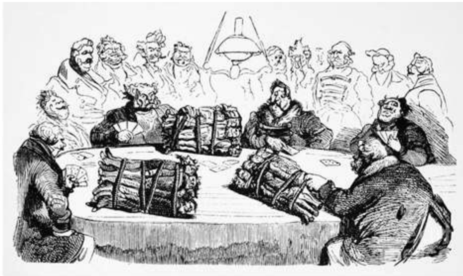
Russian noblemen gambling away their slaves. From an 1854 cartoon by Gustave Doré.

Since the collapse of communism in 1991, observers have been struck by the similarities between contemporary Russia and the society that existed before the Revolutions of 1917. With Russian literature and first-hand accounts as our guides, we shall explore pre-revolutionary Russian history from the emergence of the Romanov dynasty in 1613 until the first revolution to shake the tsarist state in 1905. En route we shall encounter the lives not only of tsars like Peter the Great, Catherine the Great, and the last Romanov, Nicholas II, but of peasants, workers, and revolutionaries. Why did autocracy emerge as the form of rule in Russia? What was the relationship between Russia and the West? Why did Imperial Russia fall in the early twentieth century? What are the historical roots of Russia's ongoing attempts to (re)incorporate Ukraine? Finally, what was unique and what was not about Russia's historical path?