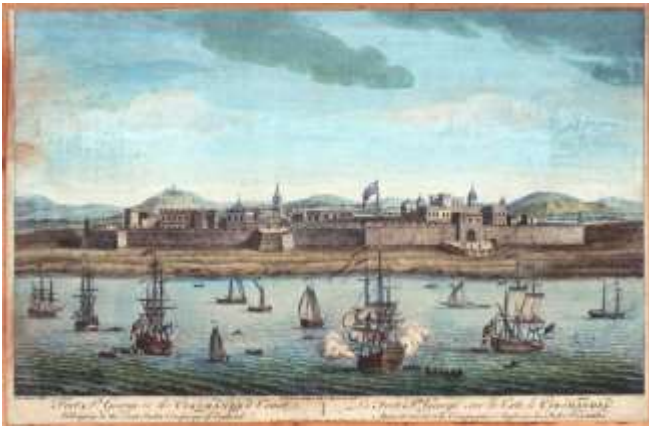
The image is an 18th c. depiction of Fort St. George, Madras.

This course will chart the growth of British military power in the years following the English Civil War and its connection to the growth and expansion of the territorial control of the British state. The first half of the course will stress the development of Britain as a "fiscal military state" and its military and naval victories (and failures) of the late 17th and 18th centuries, culminating in the Napoleonic Wars and the British victory at the Battle of Waterloo. The second half of the course will focus on the British imperial state of the 19th c. and the military challenges that it faced both in its far-flung colonial holdings, and closer to home with the ambitions of European nations. The course will conclude with British involvement in WWI on both land and sea, which marked the beginning of a new international position for the British state.