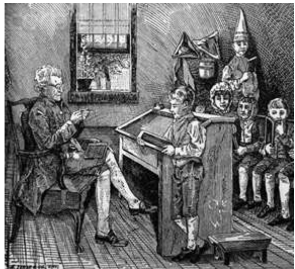
Early New England Schoolhouse