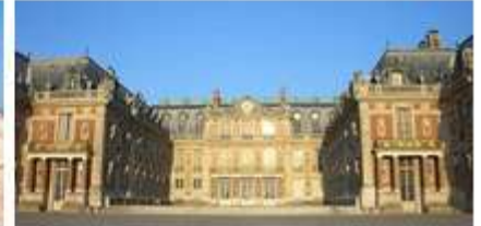
Palace of Versailles

This course traces the history of the Roman Empire from its height in the second century AD to its dismemberment (fall?) in the fifth century and the emergence of three separate successor worlds in the seventh century: in the west of Europe, Christian German-Roman kingdoms; in the east of Europe and in Turkey, a Greek-Christian empire; and in northern Africa and southwestern Asia, a Muslim-Arabic Empire. The course concentrates on the make-up of the elite. Who ran the Roman Empire? Who ran the three separate worlds the Empire became?