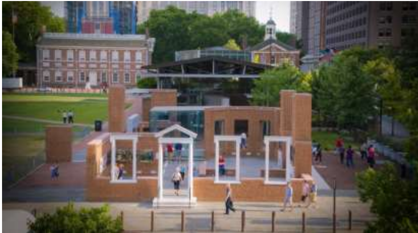
The President's House Site, Philadelphia.

Historians play a vital role in creating an engaged and informed citizenry. This seminar provides an in-depth examination of the issues and controversies that arise for historians and the public in settings such as historic sites and museums. The seminar also serves as an introduction to research in public history, a field of scholarship with local, national, and global dimensions. Each member of the seminar will research and write a site-specific case study of a public history issue. Participants also will gain training and experience with the WordPress website platform and will participate in a collaborative research and analysis assignment using Google Drive