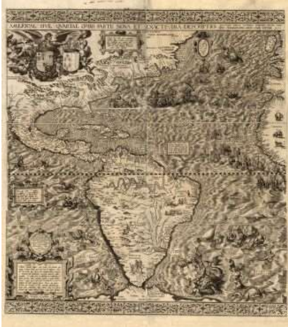
Diego Gutierrez's 1562 map of America

In this course we will trace the history of the vast region of Latin America – consisting of more than twenty separate nations today – over the course of almost 400 years, beginning around the time of Columbus's first voyage and ending with the era of the "wars of independence" in the early 1800s. We will explore how "Latin America" was born during the violent and confusing period of discovery and conquest; how contact among European settlers, native peoples, and enslaved Africans shaped social and political life in the Spanish and Portuguese colonies; how systems of labor as well as church and political institutions structured the lives of peoples in the region; and how political change and the "revolutionary moment" in the late 1700s resulted in the birth of more than twenty independent nations throughout the region by 1830. We will also explore, at the end of the course, how the colonial legacy continues to haunt Latin America even into the 21 st century. By the end of the course, you will have gained an understanding not only of what happened in Latin America, but also an understanding of why that history developed the way it did.