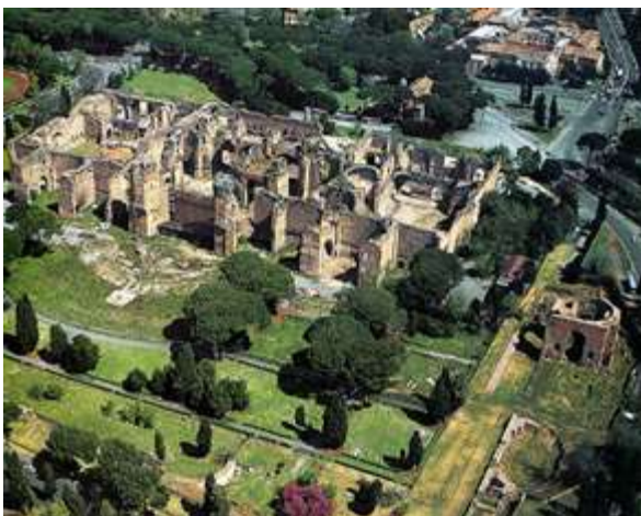
Baths of Caracalla