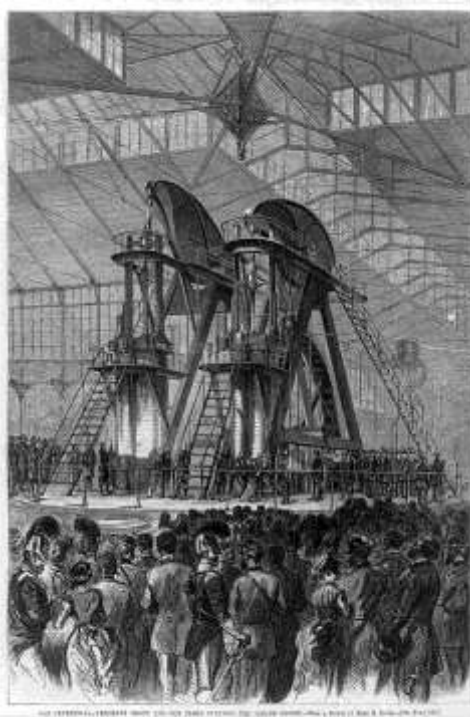
President Grant and Emperor Don Pedro of Brazil start the Corliss Engine at the Centennial World's Fair in Philadelphia, 1876

World's fairs, the enormously popular spectacles that began in the middle of the nineteenth century and continue in lesser forms today, provide a rich body of evidence for investigating the cultures and ideologies of their times. This seminar will reach beyond the popular veneer of world's fairs – the Ferris wheel, the ice cream cone, the giant reproductions of the Liberty Bell – to investigate the deeper implications of these major events, especially the ways in which they reveal the dynamics of empire. The purpose of this course is to create opportunities for individual and collective investigation of world's fairs and, by extension, the construction of empire in the modern world. Because the source material will include artifacts as well as texts, students also will gain exposure to methods of material cultural analysis. We will also explore the reproduction of world's fairs in digital form. The role of the professor in this seminar will be to guide and advise; students will dominate in discussion and will have significant input in constructing the content of the course.