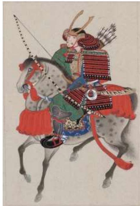
Samurai on horseback, The Great Wall of China

This course considers the history of East Asia, including China, Japan, Korea, and Vietnam, from the earliest times to the turn of the 17th century. In addition to examining political, cultural, and socio-economic developments and the evolution of gender roles in each region, we will also consider how these regions interacted with each other within larger systems of trade and cultural exchange and the impact these civilizations wrought upon the environment. In addition to using secondary sources, we will examine a variety of primary sources including inscriptions, religious texts, property and court records, novels, poetry, artworks, and archaeological and architectural evidence.