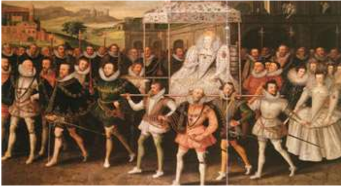
Queen Elizabeth I Procession Portrait (1601)

This course covers Europe during the Renaissance and Reformation from 1300-1600. During this time, Europe underwent tremendous cultural, political, technological, military, and religious change. Students will explore humanist thought, the rise of new military and printing technology, European explorations, court culture, the arts, witchcraft trials, and new religious discourses.