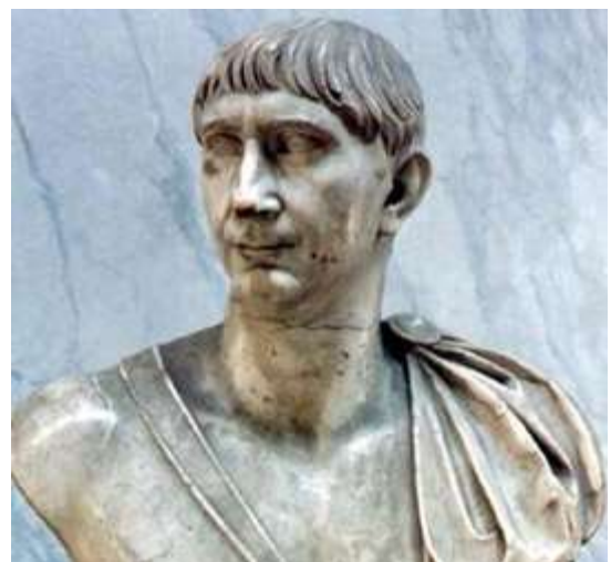
Bust of Trajan